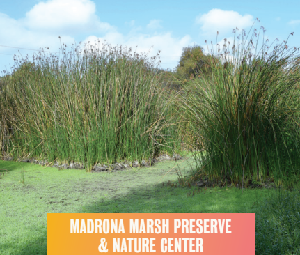
MADRONA MARSH PRESERVE & NATURE CENTER

Del Amo Fashion Center is a state-of-the-art, multi-level shopping destination, the third-largest retail center in the U.S. and the largest retail center in the Western U.S. As part of Del Amo's upscale shopping and entertainment experience, the center features more than 2.7 million square feet of shopping, several top-notch eateries including Din Tai Fung, a four-level parking structure that can accommodate nearly 2,000 cars and an indoor/outdoor aesthetic with live music and bistro lights to add ambiance. Del Amo Fashion Center provides visitors with a true Los Angeles County luxury shopping experience in the heart of the South Bay.