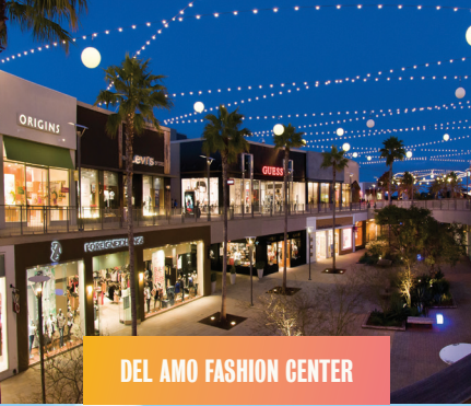
DEL AMO FASHION CENTER

The Chen Art Gallery's impressive, world-class art collection houses a beautiful array of more than 1,000 artifacts spanning 5,000 years of Chinese history. This impressive collection is also known as the largest collection of Chinese antiques outside of China. See permanent exhibits that include a gorgeous Qing Dynasty imperial throne room and an elegant Ming Dynasty bedroom. Other displays include treasures such as imperial porcelains, jade carvings, ancient bronze statues, snuff bottles and so much more.