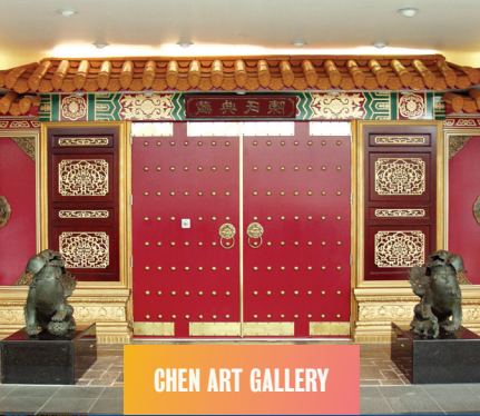
CHEN ART GALLERY